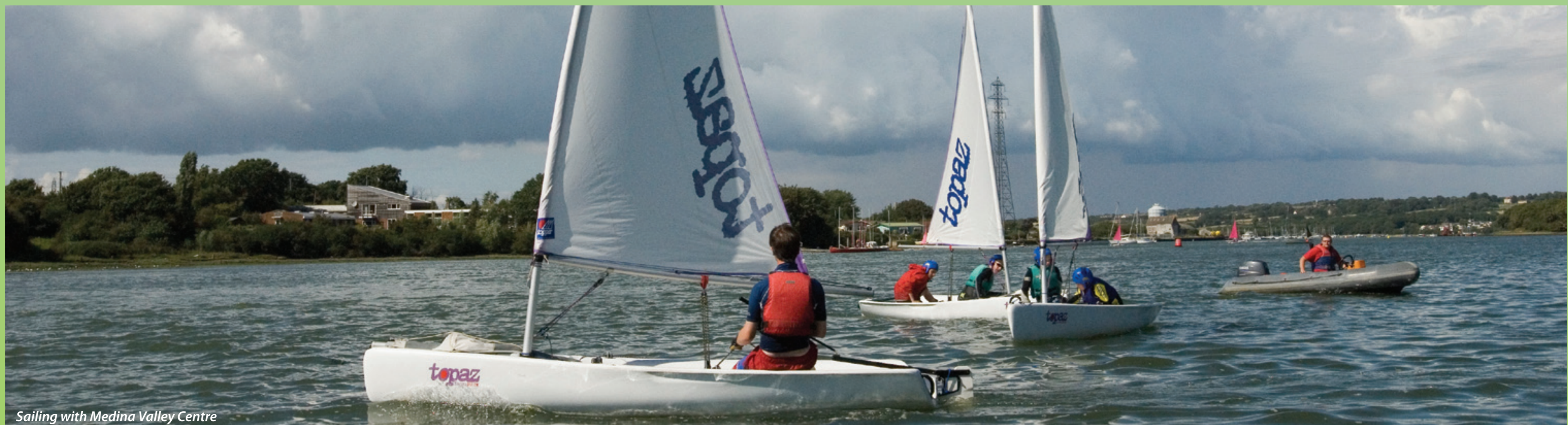
Sailing with Medina Valley Centre